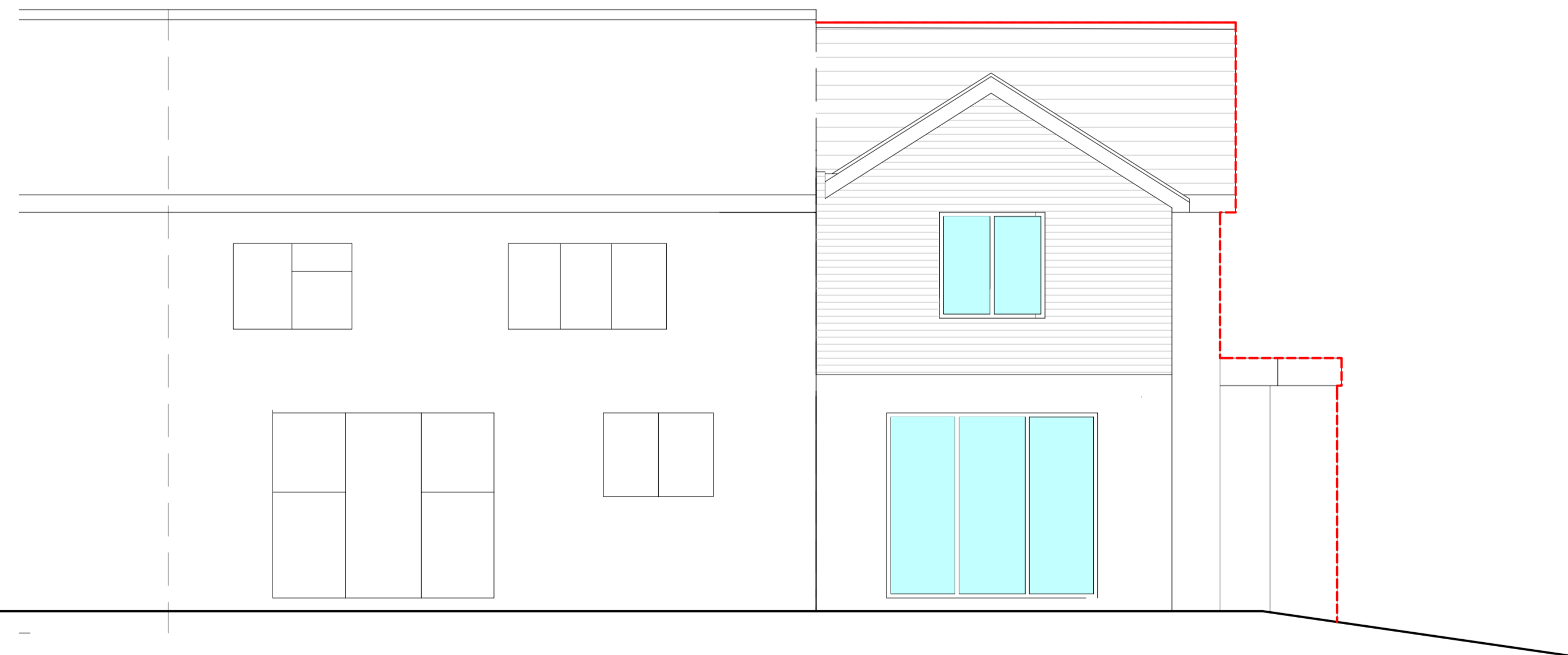
PROPOSED REAR ELEVATION scale 1-100